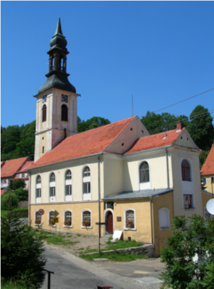
a view of the ancient protestant church, where we will work

Srebrna Gora is close to Wroclaw, an important place for art and culture in Eastern Poland. Wroclaw is cultural city of Europe. There takes place the famous Grotowski's Center. Within the village, there is a very alive local cultural center. Around the village, you have mountains, forest and an ancient silver mine renovated as a museum. The stage, the ancient protestant church, is a beautiful stage, part of the local patrimonium. Beside, the village offers cheap possibilities for lodging and food. If you need to cook your own food, you can find here groceries or you can go to the restaurant nearby. The food is included in the cost. The organisation offers the lunch and diner every day. The cooker will prepare a food according to our bodywork. Mainly the meals are cooked with local organic produces : cereals, vegetables, cheese, only vegetarian meals.